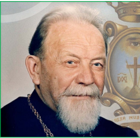
Designated Jubilee Site